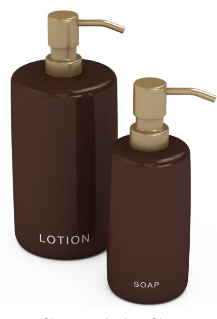
Shown in Amber Gloss