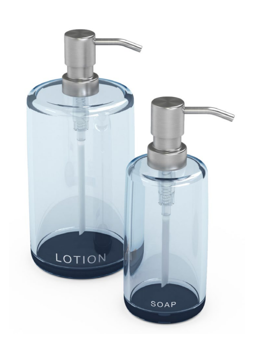
Blue "Glass" Resin