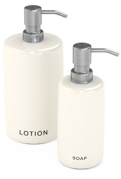
Shown in Pearl White Gloss