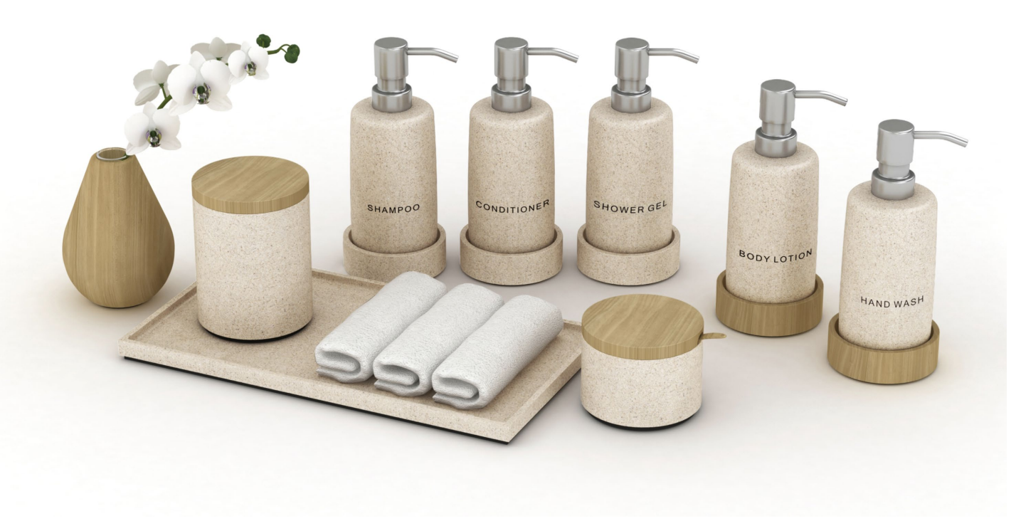
Shown in Beach Sand Resin with Wood Accents