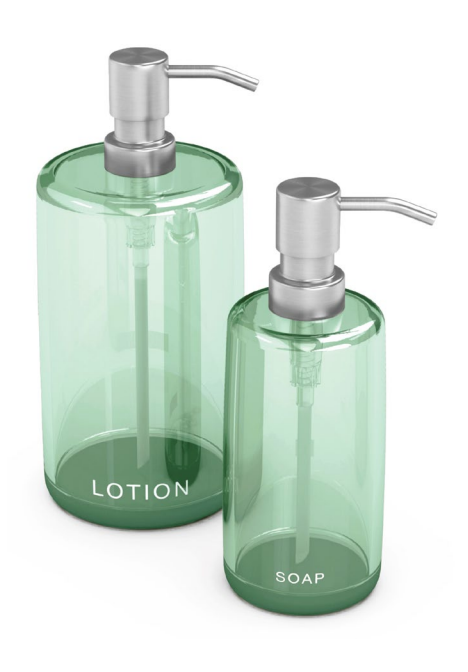
Green "Glass" Resin