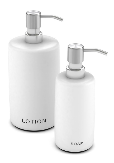
Shown in White Matte