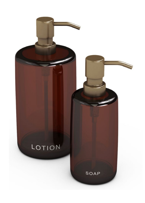
Dark Amber "Glass" Resin