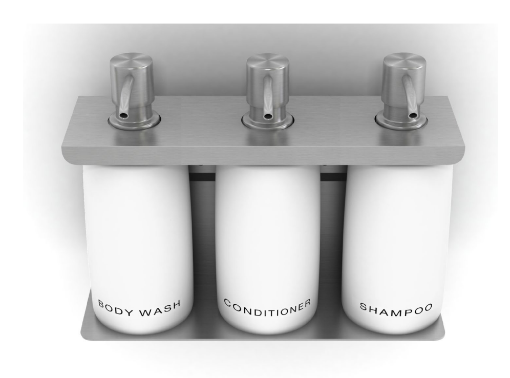
Shown in Brushed Stainless with White Matte Resin Pumps